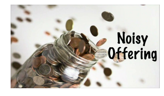
NOISY CHANGE CHALLENGE BEGINS APRIL 27TH BRING THE CHANGE!

Friday, April 18 & Monday, April 21, 2025