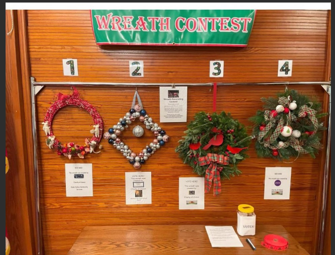
1. Carroll and Ferguson 2. Walkersville Historical Society 3. Hercules Custom Iron 4. Abloom

We want to thank all the businesses that submitted wreaths for the 2nd annual Wreath Contest. All the entries were amazing. We had 135 votes cast during the event. The Historical Society came out on top with 62 winning votes. Their charity of choice, the Walkersville High School Band, will receive $227 from the victory. We look forward to next year and even more local businesses participating.