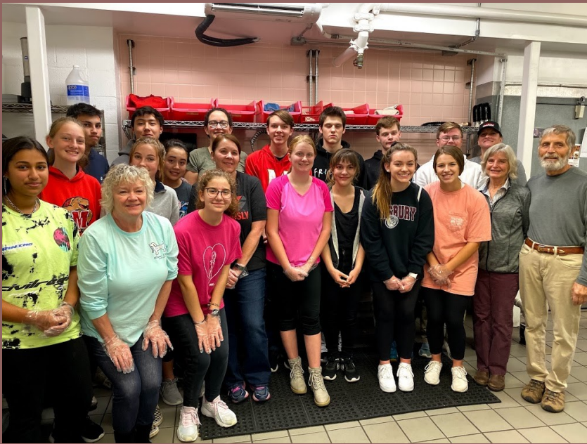
Check out the Soup Kitchen crew from this Veterans Day! Saint Paul's volunteers were joined by students from Middletown High School.